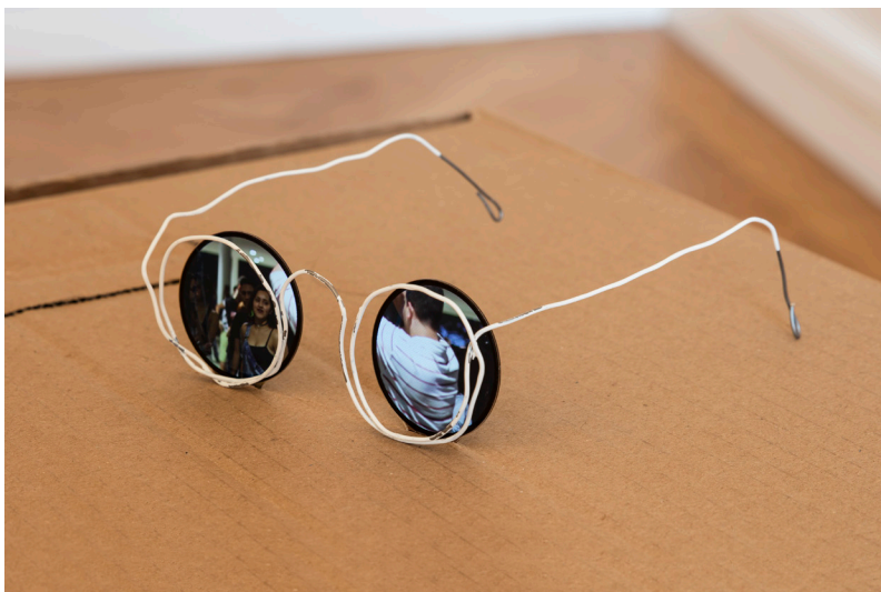
Img 5 : Real Madrid, Bounty of the mutineers , 2020 © James Bantone