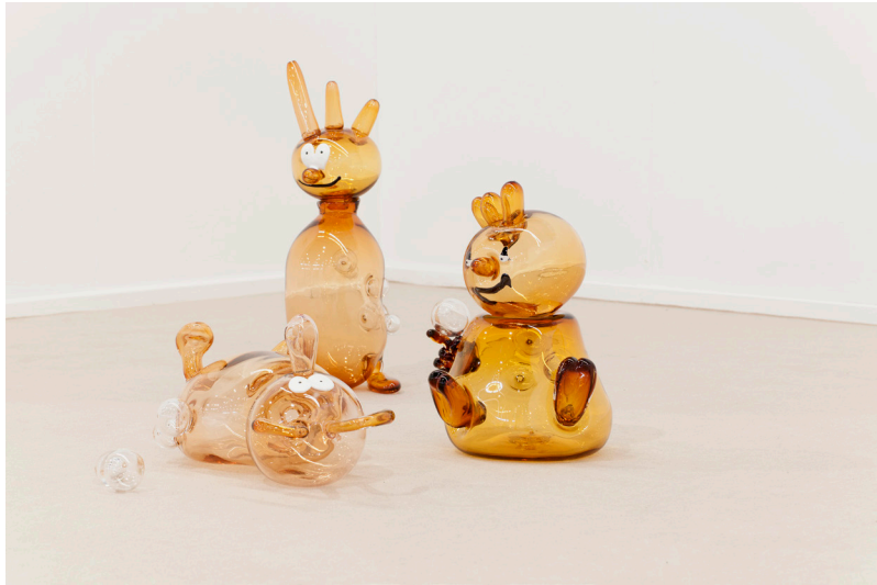
Img 1 : Real Madrid, Some days are diamonds, some days are stoned , 2018 © Guadalupe Ruiz, BAK