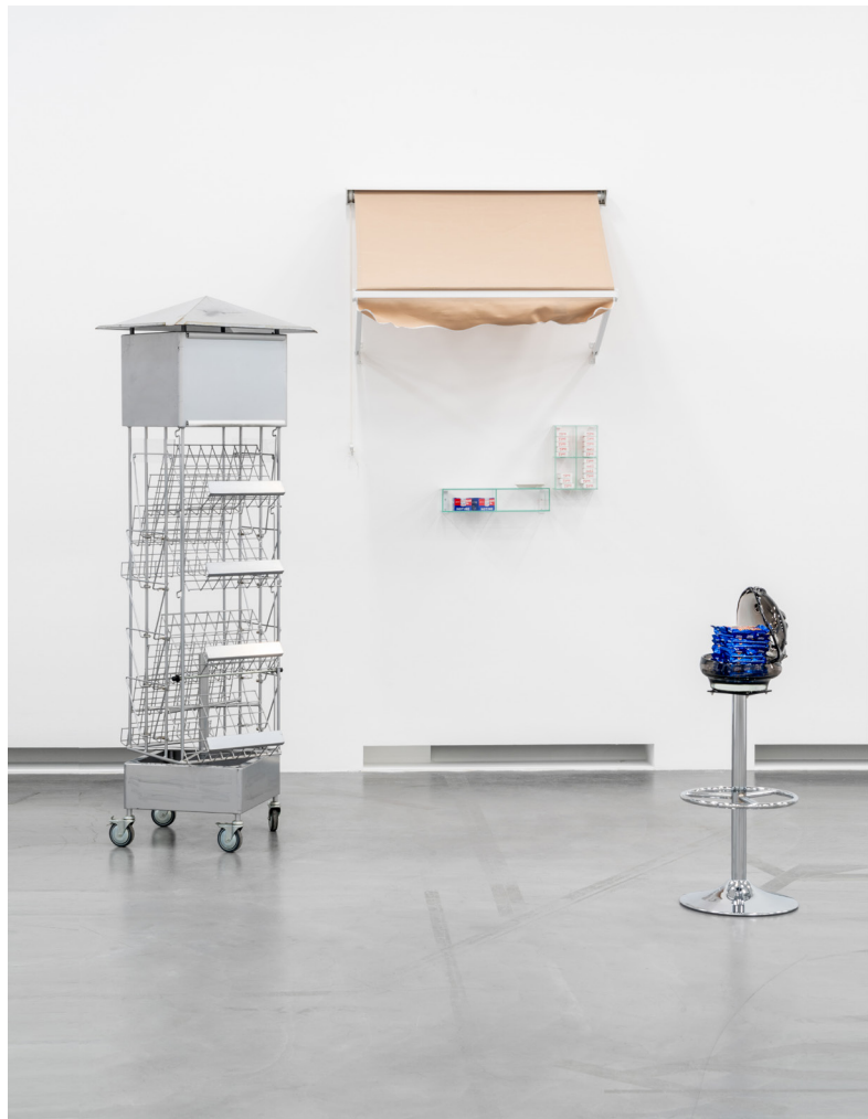
Img 2 : Real Madrid, It's my party and I'll die if I want to , 2019 © Lorenzo Pusterla

Léopoldine Turbat lturbat@ccs-paris.com T+33 (0)1 88 21 04 21