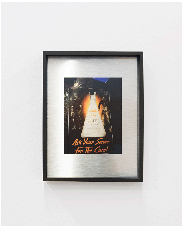
Img 6 : Real Madrid, The G.R.I.D. , 2018 © James Bantone

Léopoldine Turbat lturbat@ccs-paris.com T+33 (0)1 88 21 04 21